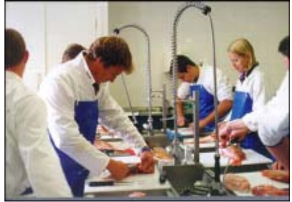
(Students learning new knife skills at Billingsgate)

Open to anyone wishing to improve their fish filleting skills.